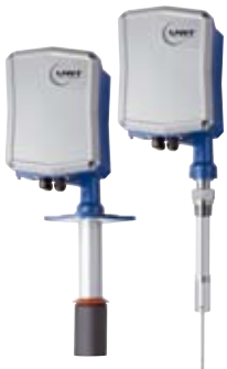
NB 3100 Rope version