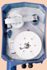
View rope/tape chamber